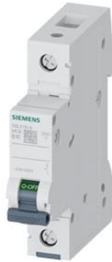
Miniature circuit breaker 230/400 V 6kA, 1-pole, B, 10 A